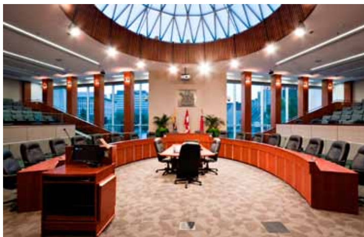
Above - Council chambers