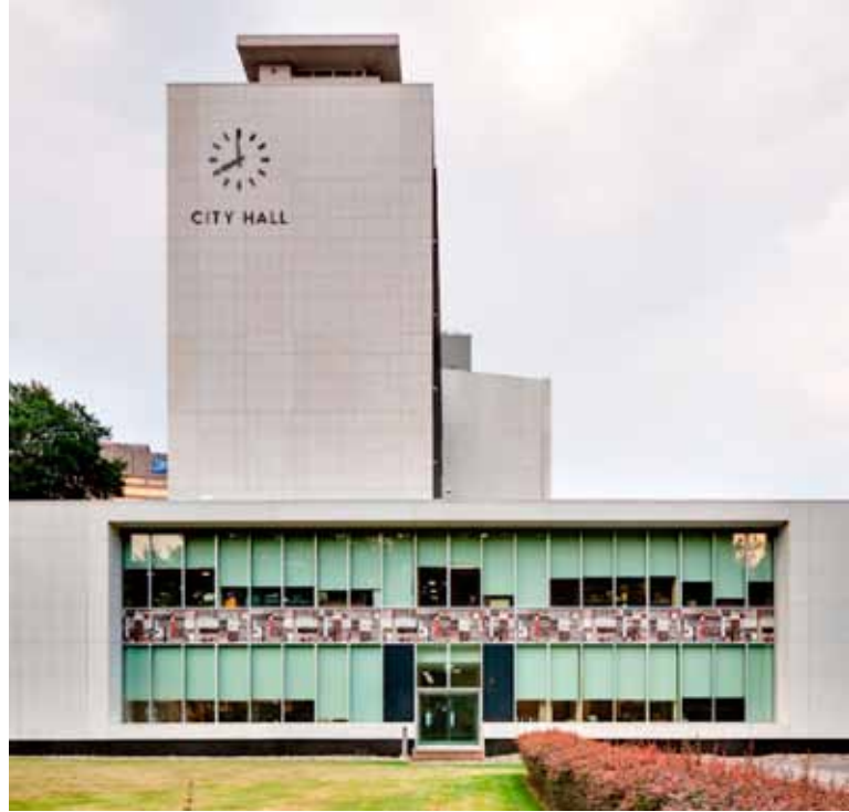
Right - Council chambers