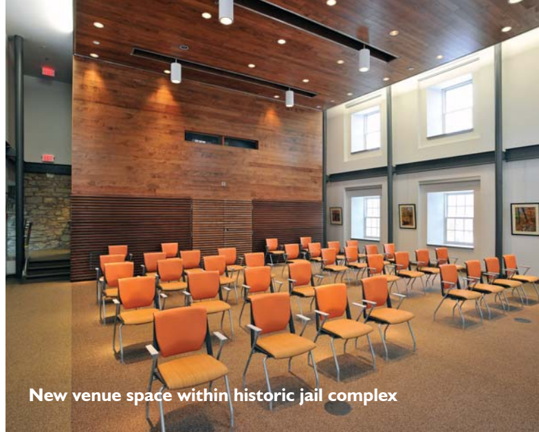
New venue space within historic jail complex

+VG Architects has designed over 40 city halls in Ontario, either as new or adaptive reuse heritage projects. The renovation of Toronto's Old City Hall buildings remains the largest stone restoration and replacement job ever undertaken in Ontario.