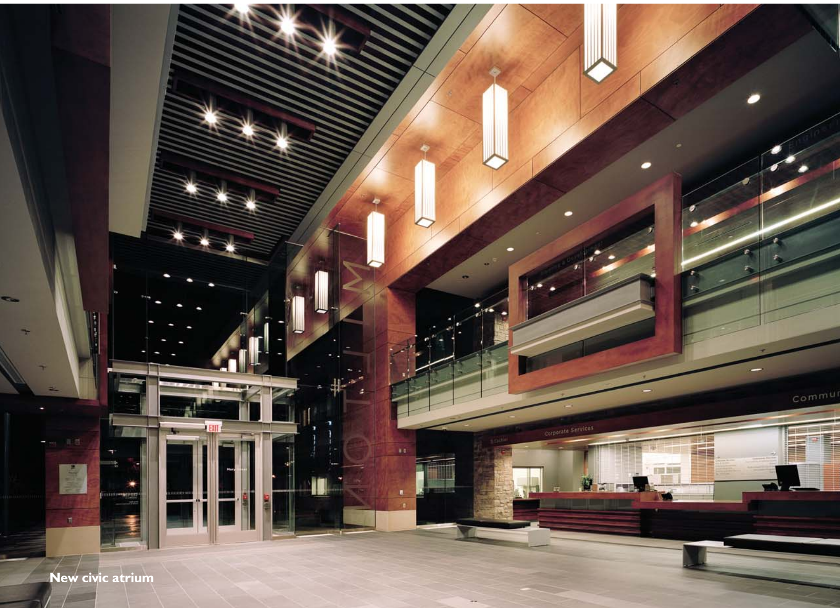
New civic atrium

See www.plusvg.com for more information.